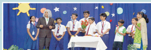
Class 7 -'LA ANHAYA, "without end.' Missile Man of India, Honorable Dr. APJ Abdul Kalam.