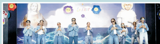
Class 6- La Fleur, Women Empowerment