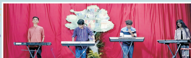
Class 11 – The darkest hours are always before dawn