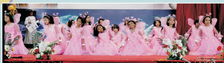
Class 1 & 2- Sard Hikaya - Storytelling

"Travelling turns you into a storyteller"